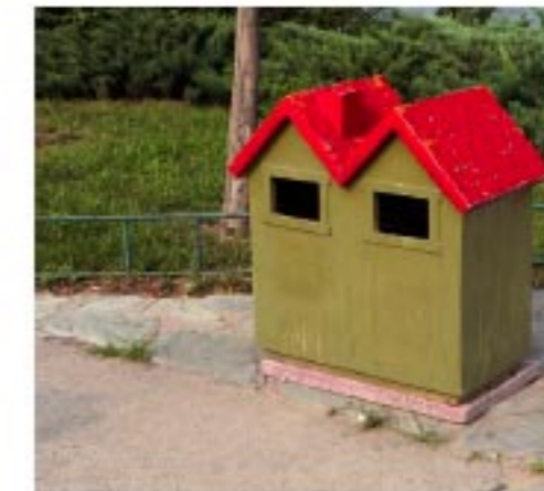
Valerian Freyberg Home Photography, 2006

"The life in the streets of Beijing is a '24 hour theater'; Streets thick with traffic, tower blocks, people on bikes, groups practicing kungfu, old ladies dancing, barbeques sizzling, old men playing cards, proud guards patrolling... Like Chinese traditional painting which is quickly executed and presented as a scroll, I have captured some of the scenes that I experienced in Beijing."