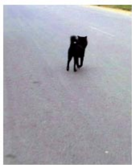
Alexander Heim Untitled Photography, 2006

"The most exciting thing was the idea of getting lost, virtually disappearing. Without the possibility of communicating with Chinese people or to read signs it was very easy to get on a wrong train or bus, arriving in a random place with a false or no idea at all where one was."