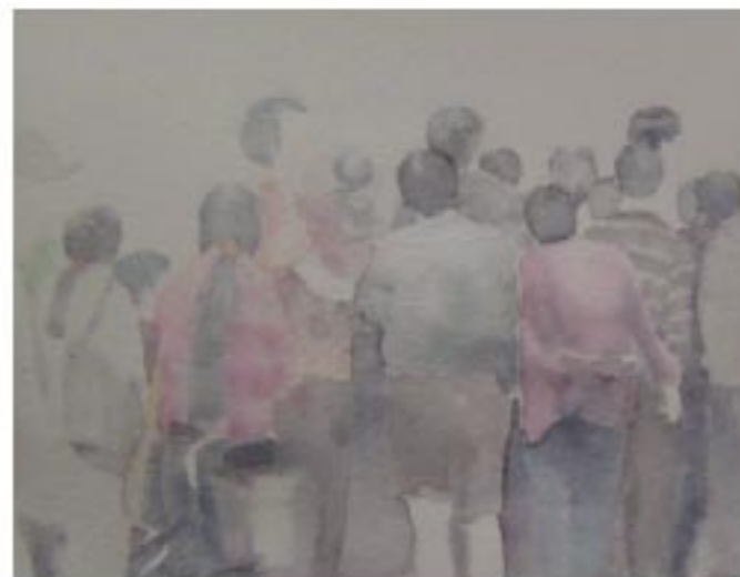
Colin Crotty Use Wisdom to create Wealth... (detail, 2005 watercolour on paper

"Being in Beijing was a break out into a large visual potpourri with very contrasting states. My interest was mainly caught by the atmosphere on the edge of the city where the new city is expanding and pushing further outside a simple every day lifestyle with its "simplicity, chaos and haziness". More or less everywhere, "old and new signs" could be found in an undefined relational state, either indicating the beginning of independent coexistence or potential harmony."